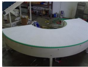
180° Curve Conveyor