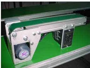
Flat Belt Conveyor