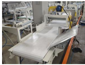
Modular Belt Conveyor