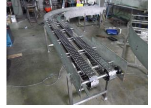
Table Top Chain Conveyor