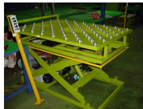
Ball Transfer Table Lifter