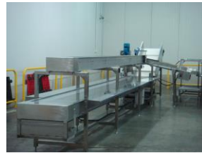
Slat Chain Conveyor